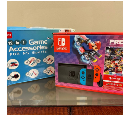
Nintendo Switch (Anonymous Donor)