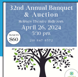
32nd Annual Banquet Friday, April 26, 2024