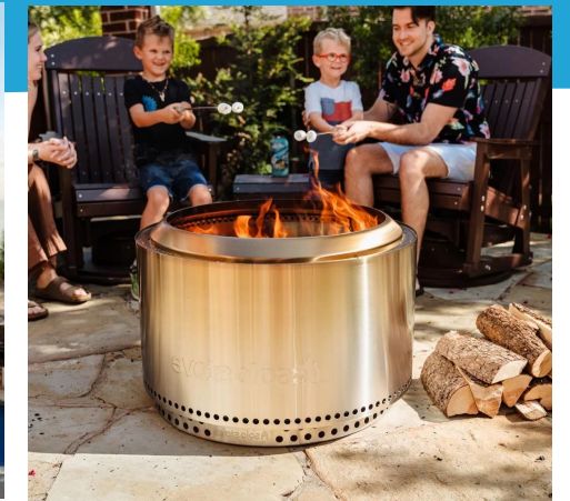
Solo Stove Canyon with Custom Cover (Donated by General Equipment)