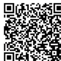
Ways to Teach Kids about Consent and Healthy Boundaries