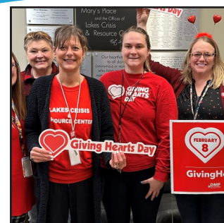
LCRC Staff Thank you!