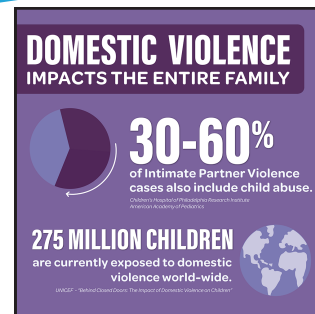
Domestic Violence Stats