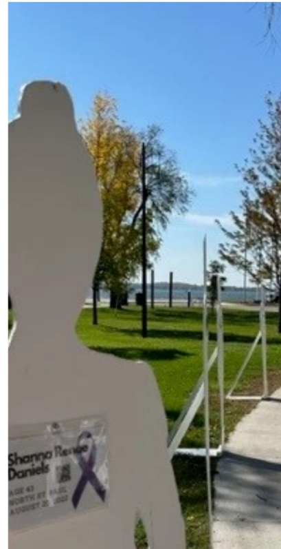
2 nd Annual Break the Silence Memorial Display will be October 1-13, 2024 in the Detroit Lakes City Park.