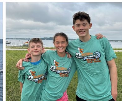
2024 Wake the World Pelican Lake, MN