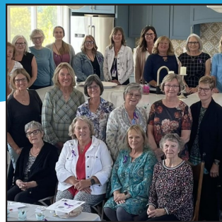
Women's ONE Hundred Luncheon September 18, 2024