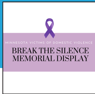
Break the Silence Memorial Display October 1-13, 2024