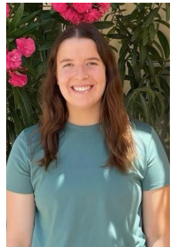
Greta Summer Intern