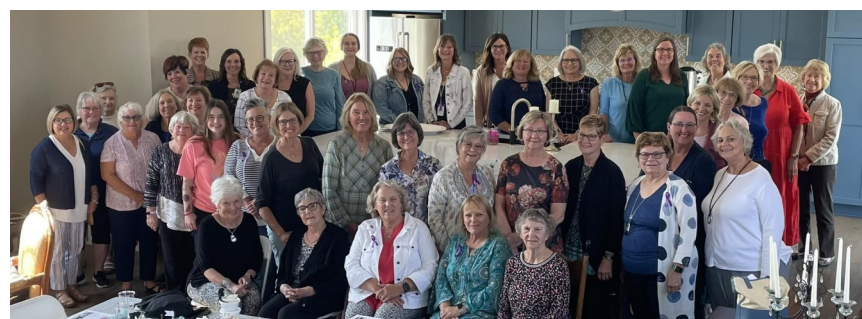
W100 Luncheon Picture taken September 2023

We invite you to become ONE of ONE-Hundred women who will make a difference in 2024 for LCRC! By standing together as ONE for this common mission, you join a dedicated group of women that make a significant impact in the lives of those in need.