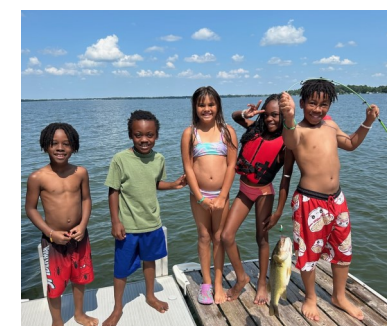
2024 Swim Camp Detroit Lakes, MN